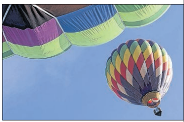
Before 1976, scenes such as this one over Jackson were illegal.

40 Years on Wednesday since hot-air balloon flights were legalized here, according to Michigan History Magazine. Read the March 9 entry at bit.ly/CMUtimeline .